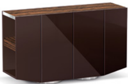
07 JASON VERTICAL CABINET CM 185,5X55 H109