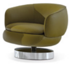
03 VIVIENNE SWIVEL LOUNGE ARMCHAIRS CM 74X77 H66