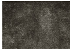
08 DIBBETS RUGS CM 450X300