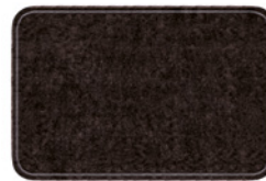
11 OUTLINE ROUNDY RUG CM 600X500