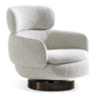
06 VIVIENNE SWIVEL BERGÈRE CM 90X92 H77