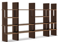
11 ZOE BOOKCASE MOD. A CM 100X46 H103