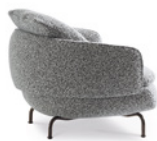
04 VIVIENNE LARGE ARMCHAIR CM 102X91 H78