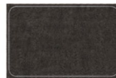
13 OUTLINE RUG CM 600X450