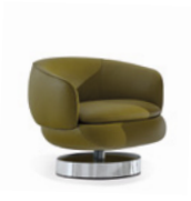
03 VIVIENNE SWIVEL LOUNGE ARMCHAIRS CM 74X77 H66