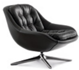
04 KENDALL ARMCHAIR CM 80X93 H73