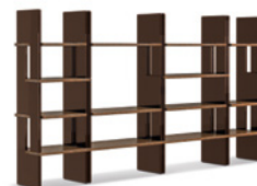
11 ZOE BOOKCASES CM 100X46 H208 MOD. B