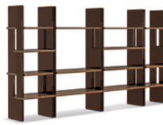
11 ZOE BOOKCASES CM 100X46 H208 - MOD. A