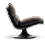
05 PATTIE ARMCHAIRS CM 78X91 H76