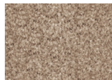
09 WISP RUG CM 600X500