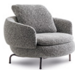
04 VIVIENNE FIXED LARGE ARMCHAIR CM 102X91 H78