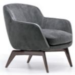
03 BELT LOUNGE ARMCHAIRS CM 73X72 H71