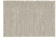
06 OSAKA RUG CM 400X400